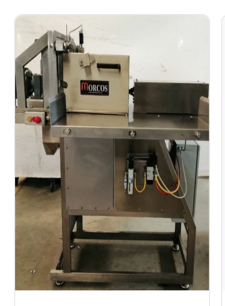
Chocolate preparation equipment Fat Blocks Grating Machine t...